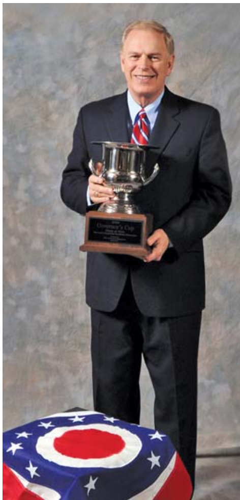
Gov. Ted Strickland with Ohio's fourth consecutive

"Because of the condition of the economy, we postponed the final phase-out of the income tax by 4.2 percent, but we have followed through on the other aspects of the tax reform," Strickland explains. "The purpose of that reform, which passed before I became governor but that I have embraced, was to have the implementation of the CAT, or commercial activity tax, that would be very low rate but broadly based. That would allow for the elimination of the corporate franchise tax and inventory tax and these other taxes that we felt were onerous and discouraging to business growth in Ohio."