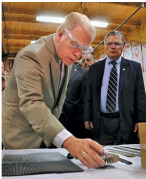
Governor Strickland looks at a small cooling component during a tour of the Catacel Corporation in Garrettsville, Ohio. The Governor was visiting the small company to discuss his education reform for a stronger economy.

In other areas, says Strickland, "We have worked to cut red tape where we could