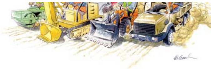
Illustrations by Bob Gravlee

Pennsylvania in a repeat of last year's pecking order, with 374, 372 and 335 projects respectively. Tennessee with 234 projects rounds out the top five.