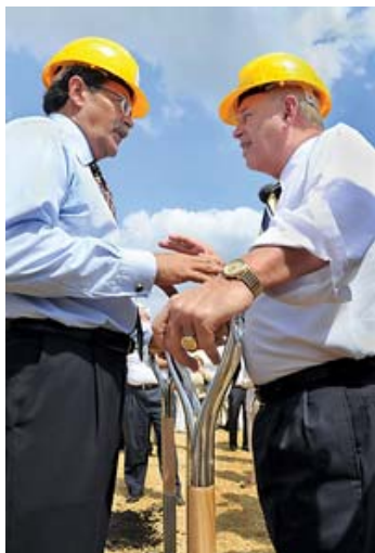
Governor Strickland and CSX CEO Michael Ward talk after participating in a ceremonial ground breaking for the Northwest Intermodal Facility near North Baltimore, Ohio, Aug. 14, 2009.

Circleville (see sidebar below); GE Aviation's $161-million expansion in Evendale near Cincinnati, retaining about 5,000 jobs; Whirlpool's $175-million expansion in Clyde; and General Mills' $70-million, 70-job expansion in Wellston. "