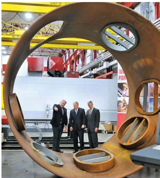
Governor Strickland is seen through a steel tower section that will be used to support a wind turbine, as he tours the automated welding area of The Lincoln Electric Company in Cleveland, Ohio. The Governor was at the company that manufactures welders and welding equipment to announce the State Energy Program American Recovery and Reinvestment Act's Wind and Solar Awards. Lincoln was a recipient of an award.