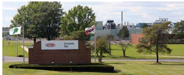
DuPont is investing $175 million in its Tedlar® PVF film expansion at the DuPont site in Circleville, Ohio. Tedlar® films provide long-term durability and performance for photovoltaic modules in all-weather conditions. DuPont expects that overall sales of its family of products into the photovoltaic industry will exceed $1 billion by 2012.

DuPont in January announced it would invest $175 million in its Tedlar PV2001 oriented film production line in Circleville, Ohio, to support global demand for photovoltaic film. The investment is over and above the $120-million investment it announced in August 2009, related to capacity expansions at plants in Louisville, Ky., and Fayetteville, N.C., for raw materials used to make the film. Those expansions are due to be complete by mid-2010. Film production in Circleville is scheduled to start up in September 2011.